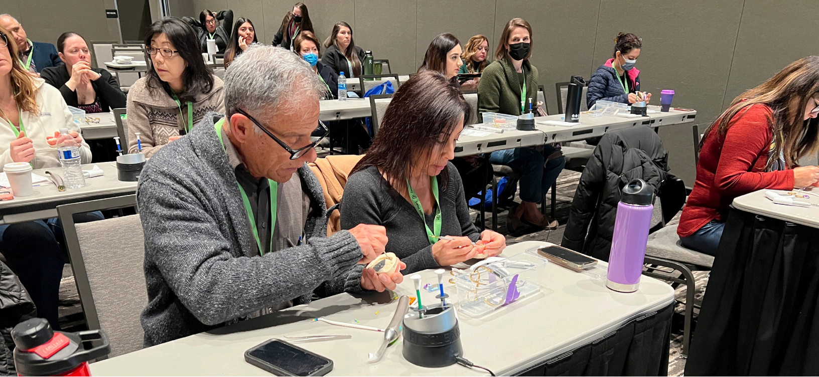
Exhibit Hall Schedule