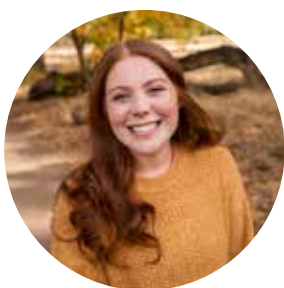
By Suzanna Warner Smiles for Big Kids Patient